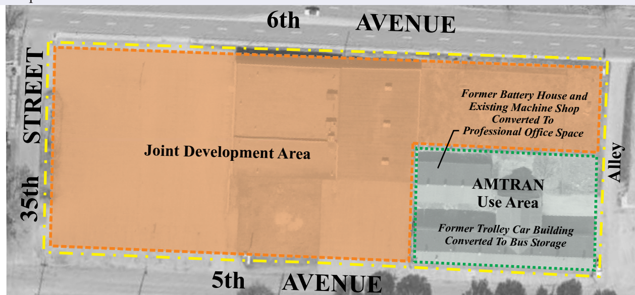
AMTRAN is looking for a private development partner for 2+ acres zoned Light Industrial available for commercial lease.